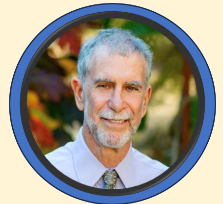
Ethicist, Author, Instructor, Forensic Psychologist, Critical Thinker